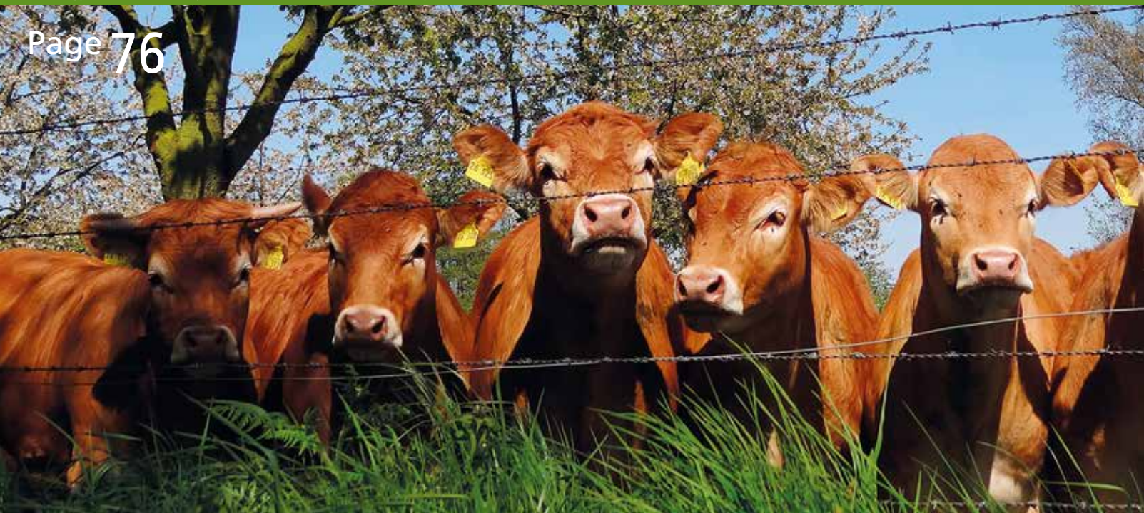
Pathology: Solanum malacoxylon, also known as Solanum glaucophyllum, is a poisonous plant that causes chronic disease and is most harmful to cattle.