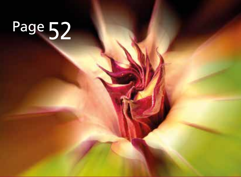
Nightmares: Ominous figures, threatening fears and delusions appear at night.