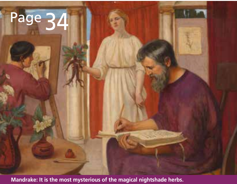
Mandrake: It is the most mysterious of the magical nightshade herbs.