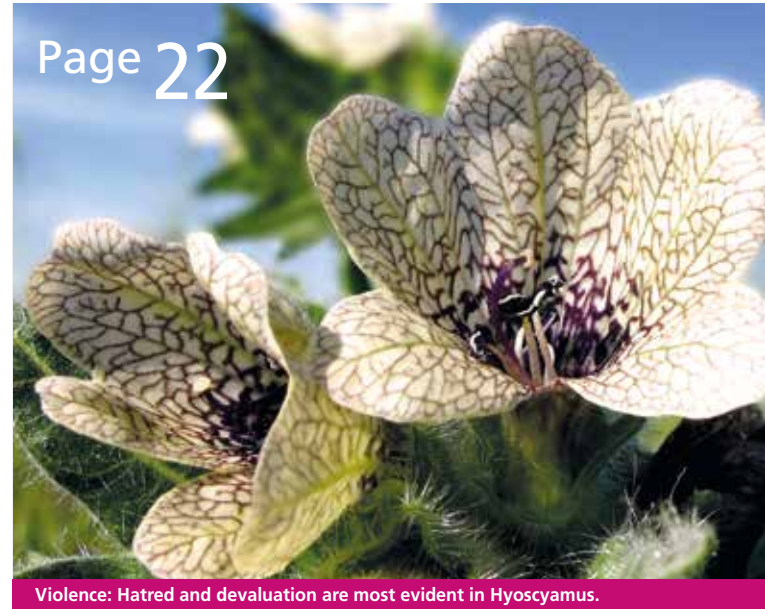
Violence: Hatred and devaluation are most evident in Hyoscyamus.