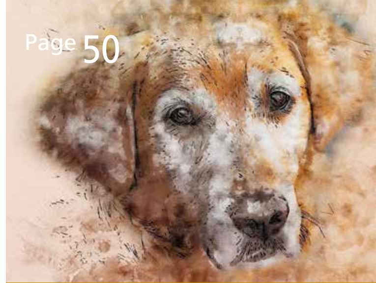
Autonomy: A golden retriever shows the lantane quality of the nightshade plants.